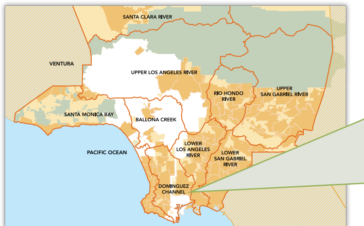
There are nine watersheds in the Los Angeles County Flood Control District in which the proposed clean water fee would be collected annually.

Stormwater and urban runoff flush bacteria, trash and other pollutants into gutters in streets and into storm drains and from there into lakes, rivers and the ocean and onto beaches. Waterways throughout Los Angeles County have been found to be polluted above acceptable levels under the federal Clean Water Act and other state and federal laws.